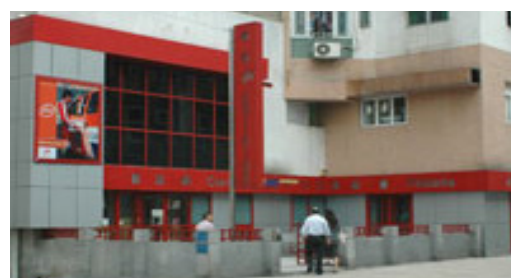
Post Office at Taipa Island