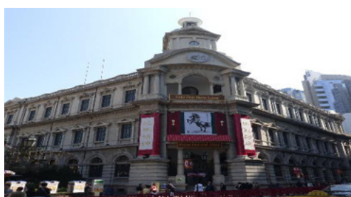
General Post Office at Macau Peninsula

For more information, you may refer to: http://www.macaupost.gov.mo/